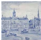
ym-A24 - Motif 4 - Blue painting - inked glaze - shiny