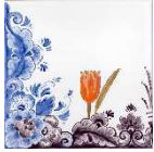
ym-A35 - Flowers 3