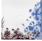
ym-A36 - Flowers 4