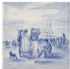
ym-A22 - Motif 2 - Blue painting - inked glaze - shiny