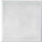
ym-A39 - Tile 20x20 - inked glaze - shiny