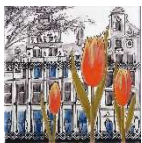
ym-A31 - Houses 4