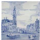
ym-A23 - Motif 3 - Blue painting - inked glaze - shiny