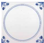
ym-A18 - Edge motif - Blue painting on matt white glaze