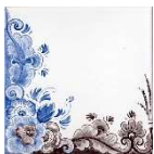
ym-A33 - Flowers 1 - Blue and black painting, on matt white glaze