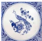
ym-A15 - Peacock - Blue painting - inked glaze – shiny