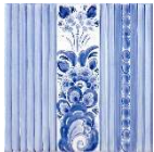
ym-A12 - Stripe - Blue painting on matt white glaze