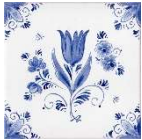
ym-A3 - Tulip - Blue painting on matt white glaze