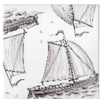
ym-A7 - Sailing boat - Black painting on matt white glaze