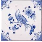
ym-A1 - Bird standing - Blue painting on matt white glaze