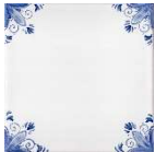
ym-A6 - Edge motif - Blue painting on matt white glaze