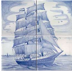
ym-A27 - Boat 4T - Blue painting - inked glaze - shiny