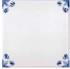
ym-A19 - Edge motif - Blue painting on matt white glaze