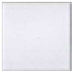
ym-A40 - Tile 20x20 - Matt white glaze