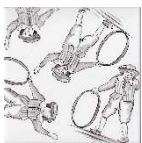
ym-A9 - Playing children - Black painting on matt white glaze