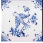
ym-A2 - Bird flying - Blue painting on matt white glaze