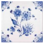
ym-A4 - Flowers - Blue painting on matt white glaze