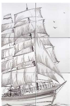
ym-A26 - Boat 6T - Black painting on matt white glaze