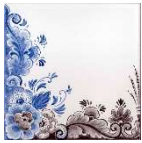
ym-A37 - Flowers 5