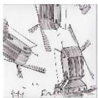
ym-A8 - Windmill - Black painting on matt white glaze