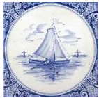
ym-A14 - Sailing boat - Blue painting - inked glaze - shiny