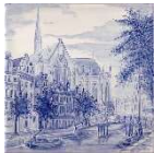
ym-A21 - Motif 1 - Blue painting - inked glaze - shiny