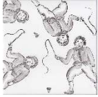
ym-A10 - Playing children- Black painting on matt white glaze