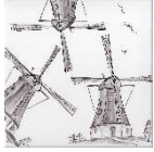
ym-A11 - Windmill - Black painting on matt white glaze