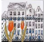
ym-A28 - Houses 1 - Blue and black painting on matt white glaze - partial inked glaze, with planinum ornaments