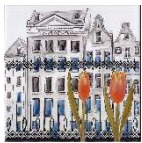
ym-A32 - Houses 5