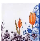
ym-A34 - Flowers 2