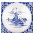
ym-A17 - Windmill - Blue painting - inked glaze - shiny