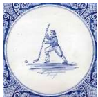
ym-A13 - Children - Blue painting - inked glaze - shiny