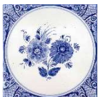
ym-A16 - Flowers - Blue painting - inked glaze - shiny