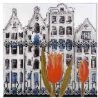
ym-A29 - Houses 2