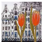
ym-A30 - Houses 3