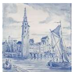
ym-A25 - Motif 5 - Blue painting - inked glaze - shiny