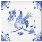
ym-A5 – Bird standing - Blue painting on matt white glaze