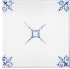
ym-A20 - Edge motif - Blue painting on matt white glaze